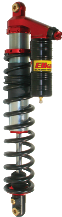
STAGE 4 PIGGYBACK