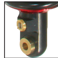
REBOUND DAMPING ADJUSTMENT