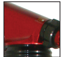
HIGH/LOW-SPEED COMPRESSION DAMPING ADJUSTMENT