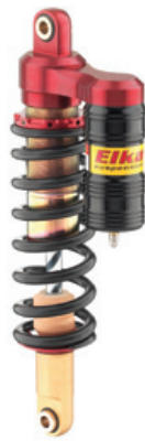
STAGE 2 PIGGYBACK