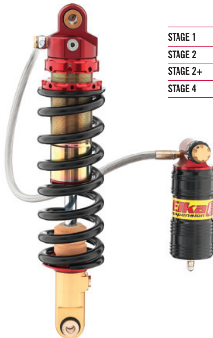
STAGE 4 REMOTE RESERVOIR