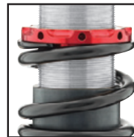
SPRING PRELOAD ADJUSTMENT