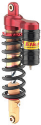
STAGE 2+ PIGGYBACK